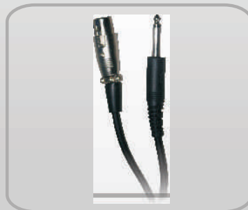
Cable XLR to Ø6.3mm plug