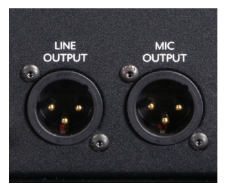
The HDI's balanced outputs

The HDI also features a Processed Output, which is an unbalanced 1/4" TS connection that provides the option for signal to be fed to a stage amplifier or an amp profiler unit while retaining the character and tone imparted by the front panel controls of the HDI. This can be used to add distortion and saturation before feeding a clean amplifier, or to impart some transformer warmth before connecting to a digital amp modeler. The Processed Output can be used at the same time as the balanced XLR outputs and the front panel Thru output.