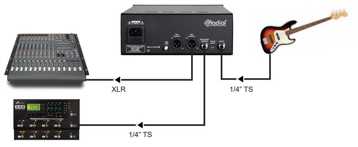
Using the HDI Processed Output