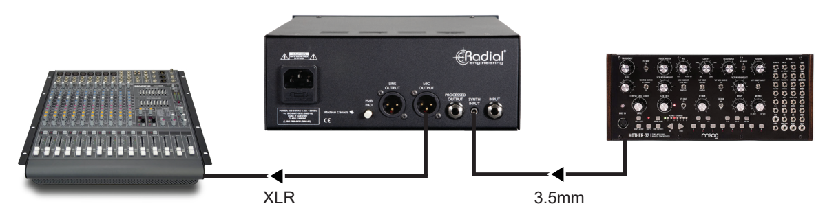
Connecting a mono synthesizer to the HDI

The rear panel of the HDI also features a 3.5mm mono Synth Input, allowing an easy access point for instrumentalists that utilize modular synthesizers, and providing the advantages of running their signal through the HDI's unique distortion and transformer saturation circuitry to impart warmth and grit onto their signal. Connect your modular synth to this input using a 3.5mm (1/8") cable - this input will override both 1/4" inputs when connected. This synth input is about 15dB lower than the HDI instrument inputs to compensate for the additional gain provided by the synth outputs. The Synth Input may also be useful for bringing in hot line-level signals from a DAC for processing.